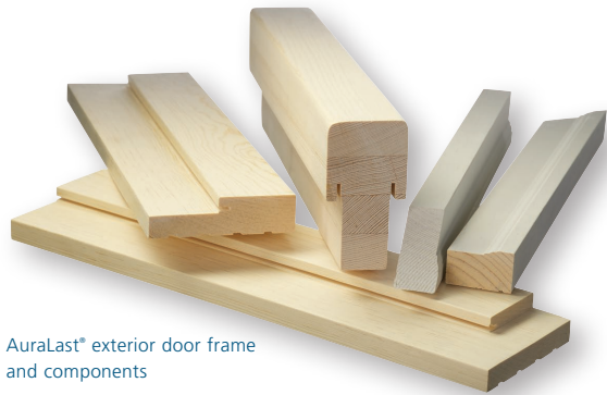
AuraLast® exterior door frame and components