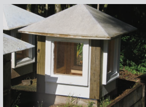
AuraLast wood was put to the test for several years in a very harsh and humid environment.

In pine wood, AuraLast acts as a grain sealant allowing for a beautiful, even, stain finish. On the other hand, non-AuraLast requires a pre-sealant application to achieve the same appearance.