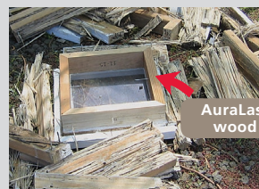
As you can see, after removing the window from its untreated framework, the AuraLast wood clearly withstood the harsh elements of wood decay and termite infestation. AuraLast wood is clearly the survivor!